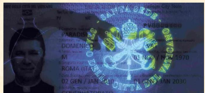
DATA PAGE - UV