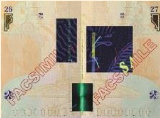
VISA PAGES – OVI/UV ink – see through – security thread