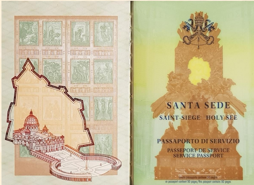
LEFT ENDPAPER and PAGE 1