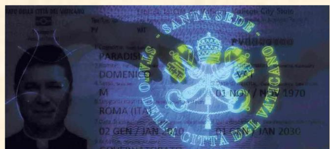
DATA PAGE - UV