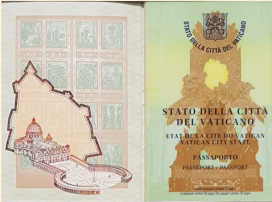
LEFT ENDPAPER and PAGE 1