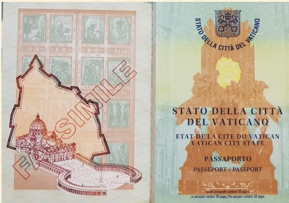
LEFT ENDPAPER and PAGE 1