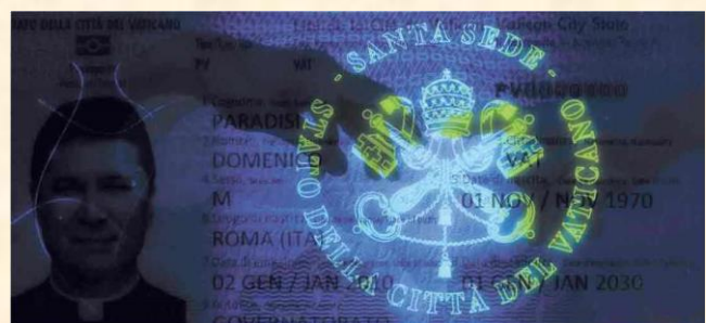
DATA PAGE - UV