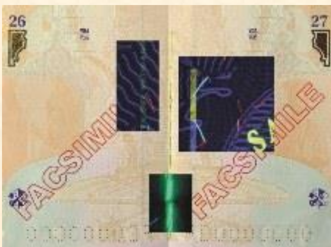
VISA PAGES – OVI/UV ink – see through – security thread